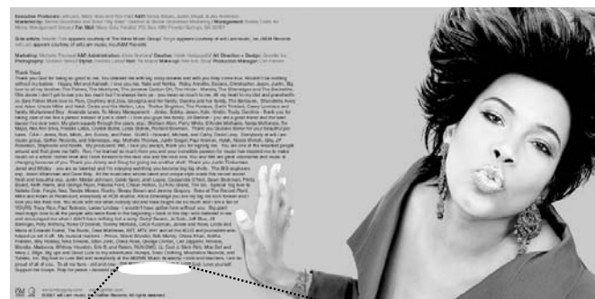
...and is yours so love... Elect Barack Obama in 2008.

Celebrity endorsements are all the rage in politics these days. Take soulful songstress Macy Gray, who in the liner notes for her new album, "Big," writes "Elect Barack Obama in 2008." Spelling aside (it's "B-A-R-A-C-K"), the decision by the pop star to weigh in on the presidential race speaks volumes about how politics somehow became cool again. Need more evidence? Rapper/producer Timbaland opened up his Florida home last month for a fundraiser for Sen. Hillary Rodham Clinton (D-N.Y.).